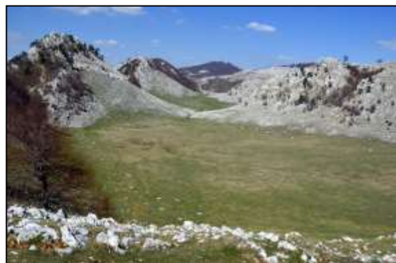
Fig. 2. „Poiana Porcului” sinkhole (the longest one).