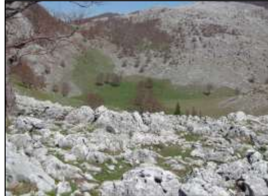
Fig. 4. „Crovul Mare” sinkhole.