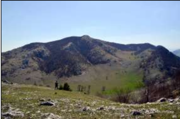
Fig. 3. „Crovul Medvedului” sinkhole (the biggest one).